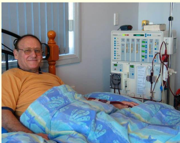
Figure 4, Patient performing nocturnal haemodialysis