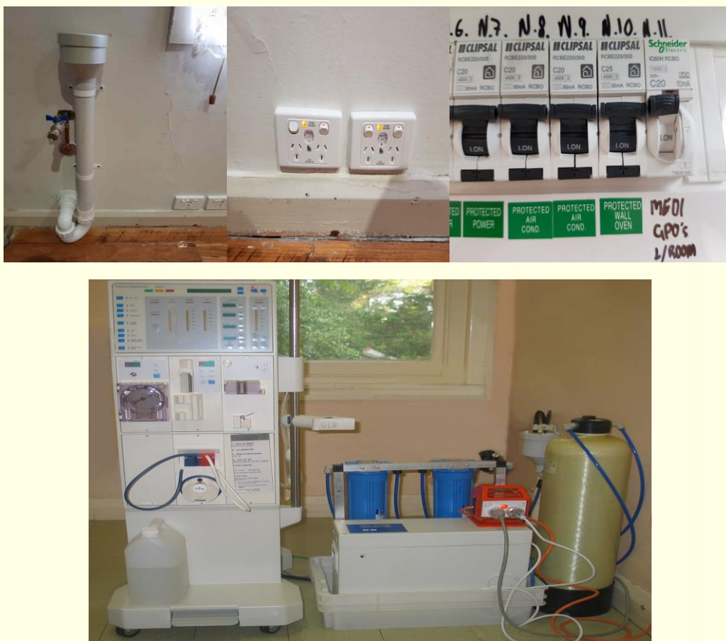
Figure 1, Plumbing & Electrical modifications and Haemodialysis machine & reverse osmosis machine

Haemodialysis uses large amounts of water; as a result, plumbing modifications in the dialysis room are required for the machine. The training nurse will provide you with a plumbing diagram. You may need to provide modified power points for the dialysis machine. The SDC technician, who will visit your home as part of the home inspection, will mark the power points requiring modification for the electrician and will discuss a suitable location for the dialysis machine and plumbing. These should only be fitted by a qualified plumber and electrician.