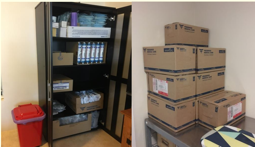
Figure 2, stock storage ideas

The choice of the room used at home for dialysis is up to you. Think about where you wish to spend your time whilst on dialysis. You will need a minimum of 2.5metres by 2.5metres of clear space, for a chair and the machinery. You also need an area equivalent to a wardrobe, for the storage of dialysis supplies. A combination of shelving and an open area is ideal.