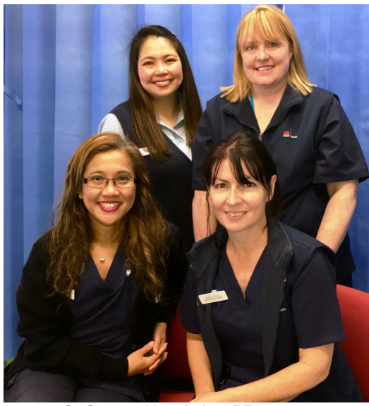
St George Hospital — PD nurses