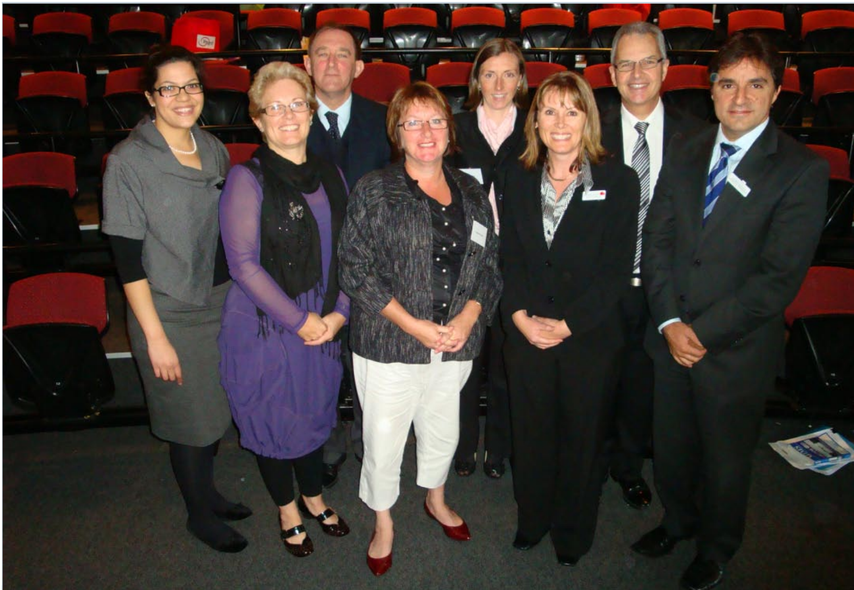
Renal Palliative Care Symposium St George Hospital, Kogarah. Aug 13, 2010